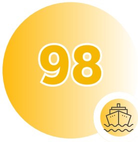
Total port in HCMC