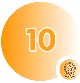
The world's most efficient container port